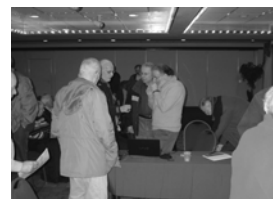
Original photo before editing with Photoshop Elements. Note cropping and cleanup of the desk

The presentation was well received by the attendees and there were many good questions. □