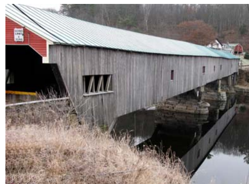
Covered Bridge by Les Muldorf

Finally, ERUNT, Emergency Recover Utility NT was mentioned. It allows one to keep a complete backup of the registry and restore it when necessary. ERUNT also contains NTRegOpt which optimizes the registry. (Note 14 reviews ala Google gave it the top rating of 5 stars.) ☐