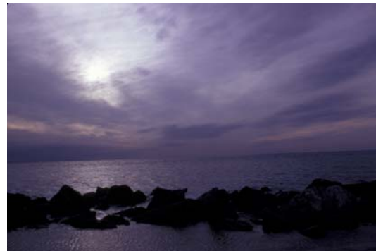
Wintery Beach