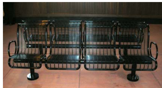
Chairs at the Railway Station by Les Muldorf